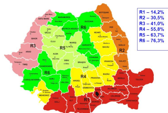
Fig. 3. Map coverage on ecological macro-regions of Romania

snow and wind strength, requires the achievement of the protective forest curtains in the Romanian Plain (Bărăgan), in southern Moldova and to a lesser extent in the Western Plain. (Fig. 3) [4]