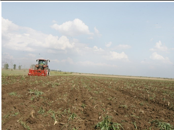
Fig.1. Execution of the soil loosening work in strips

Vertical lying work consists in loosening and mobilizing the soil on a depth of 20-30 cm, or even deeper, without turning the furrow. The soil surface remains covered after sowing vegetal remains in a convenient proportion (over 30%). At the same time, soil compaction is shorter in the short term.