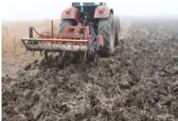
Fig.2. Execution of scarifying and rolling work

Vertical lying work consists in loosening and mobilizing the soil on a depth of 20-30 cm, or even deeper, without turning the furrow. The soil surface remains covered after sowing vegetal remains in a convenient proportion (over 30%). At the same time, soil compaction is shorter in the short term.