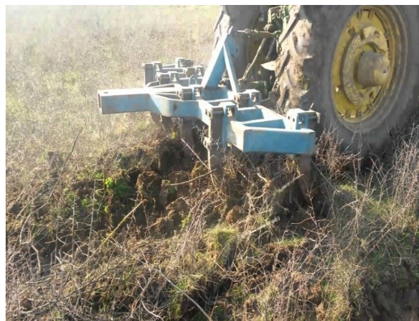
Fig.3. Execution of the deep licking work

infiltration of water and air from the upper layers.