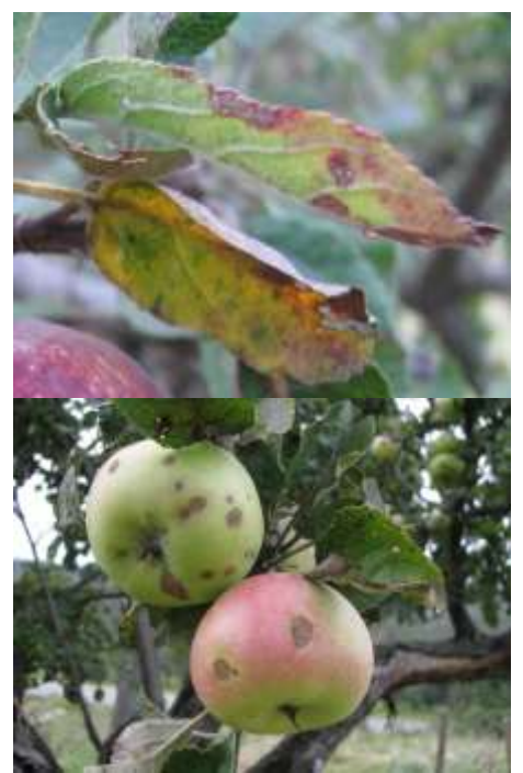
Fig. 2. Jonathan' Venturia inaequalis attack on leaves of 'Jonathan' (upper image) and fruits of 'Poynik Alma' (bottom image)

The fruits were observed on spot without harming the trees (Fig. 2, bottom image).