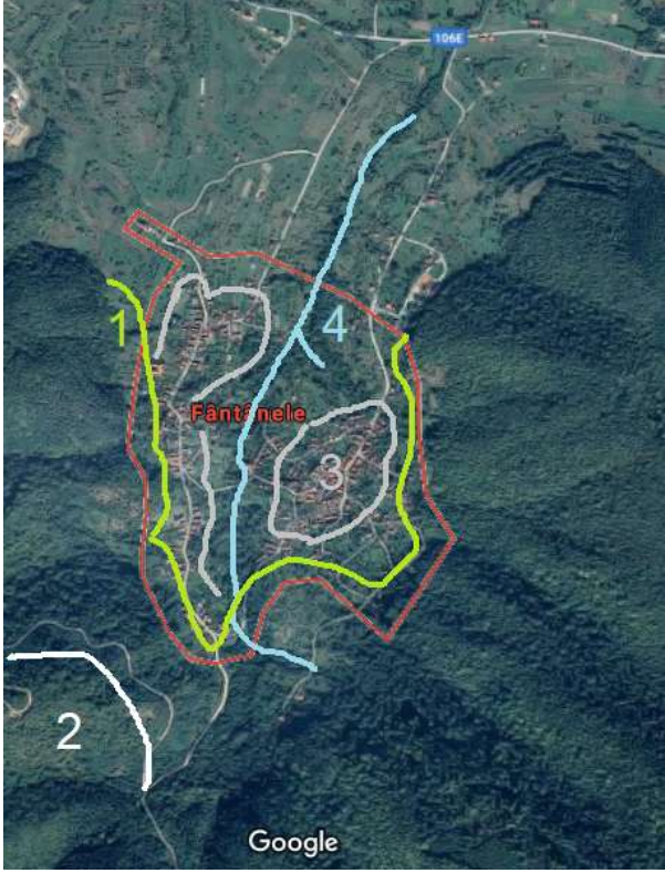
Fig. 1. Traditional orchards distribution within the landscape sub-units of Fântânele: 1- along the forest canopy area, 2- in the mountain at 1,000 m, 3 - inside the village and 4 - along the creek

Place of investigations : Fântânele (45°45'23" N and 23°55'28" E) is a small village positioned in Sibiu county which integrates in the rural area and agricultural land area traditional orchards for four types of landscape sub-units (Fig. 1).