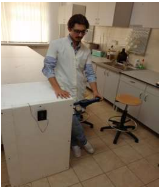
Photo 6. Temperature measurement during the experiment

The measurements are presented in the table below.