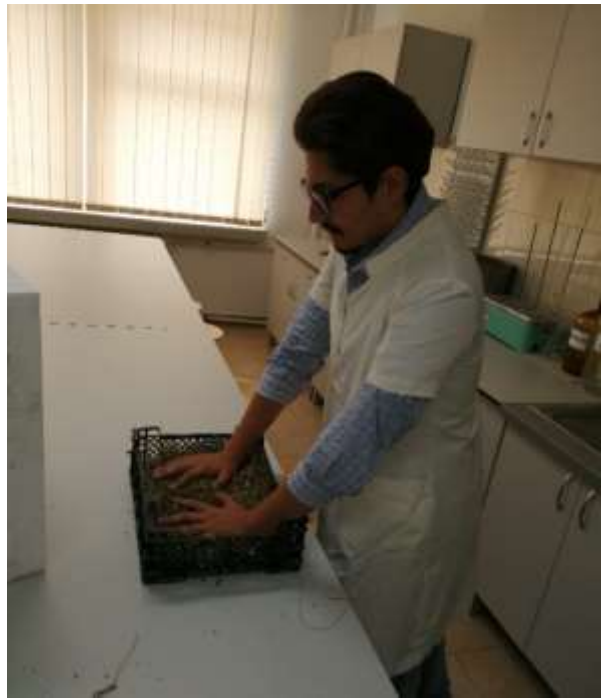
Photo 3. Distribution and pressing of the vegetal material

wire in the form of a grid. It was then followed by soaking the material in the solution previously prepared and draining the water by keeping the crate horizontal.