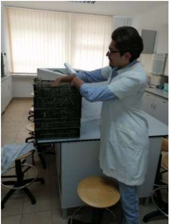
Photo 5. Settling the plant biomass in the box set