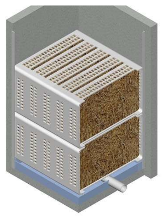
Photo 2. Convective air circulation inside the module