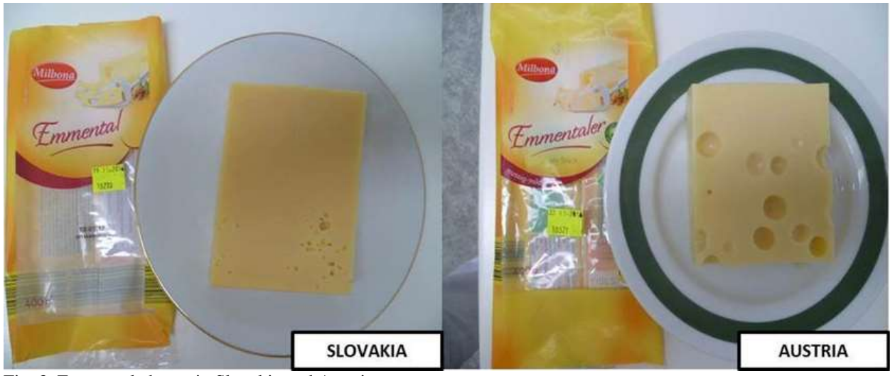
Fig. 3. Emmental cheese in Slovakia and Austria Source: [16].

Emmental cheese, in Slovakia, does not have the usual structure, having a light yellow color and a different texture, while in Austria it has the normal appearance, color and texture. (Figure 3).