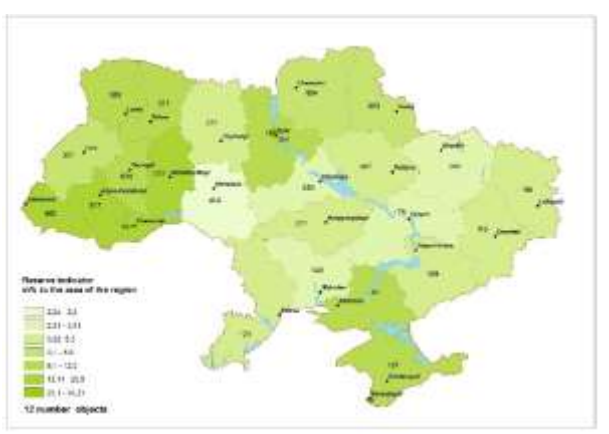
Fig. 1. The indicator of the reservation of regions of Ukraine

Thus, the indicator of the reservation ranges from 2.24 to 15.71 % in the various regions of Ukraine.