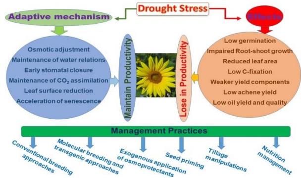
Fig. 1. The drought stress and management practices to sunflower

The modern management of drought in the sunflower includes a series of practices that can have the effect of maintaining its productivity (Figure 1).