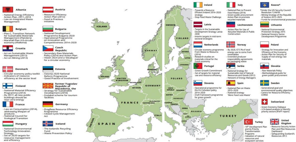
Fig.3. More from less-material resource efficiency in Europe

disposal 50% reduction of food waste by 2030. -Introduce minimum standards and obligations to water users on mandatory recycling rates by sector. In a study on the efficiency of material resources, published earlier this year by the European Environment Agency, "More from less - material resource efficiency in Europe", 32 countries in Europe were evaluated.