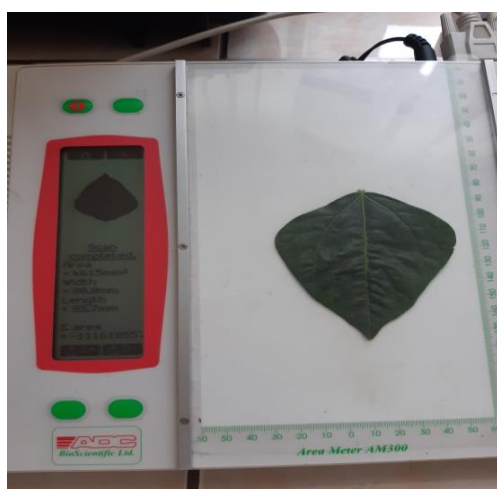
Photo 3. Measured the area of a cowpea leaf with the Area Meter AM 300

Leguminous plant that symbiotically synthesizes 80.6% of the nitrogen needed for nutrition, cowpea need this element, at the beginning of vegetation until the installation of microbial activity in the soil in order to carry out the normal metabolism of the plant [15], [7], [9]. The results obtained when fertilizing the cowpea crop with N60P60K60 and presented in Table 3, showed an increase in grain production by 453.8 kg/ha, compared to the use of the dose of N30P30K30, an increase that is within the limits of the experimental error ( p < 0.05 ).