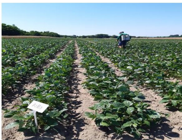
Photo 1. Application of foliar fertilization with Vermorel

fertilization with N60P60K60 + foliar fertilization with the product Maturevo 3.35.35 + ME, in a dose of 3 kg/ha, in the phase of 6-8 leaves of the plant. Ensuring a rational fertilization of cowpea, in relation to the requirements of the plant and the state of soil fertility, can regulate the mechanisms of plant protection against stressors on sandy soils. Thus, it was noticed the increase of the percentage of bound water from 2.4-2.9%, values registered in foliar non-fertilized variants, to 3.2-3.6%, by foliar fertilization with Maturevo 3.35.35 + ME, in a dose of 3 kg / ha, in the phase of 6-8 leaves of the plant. The concentration of vacuolar juice was differentiated depending on the root and foliar fertilization, registering values in the range of 7.7-9.9%.