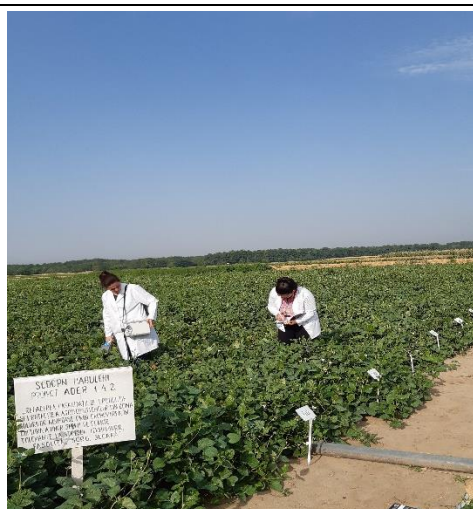
Photo 2. Observations in the experimental field with cowpea Source: Original.