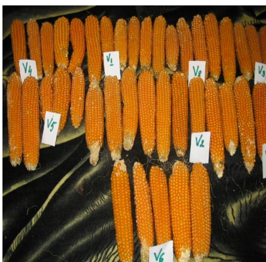
Photo 2. Maize beans subjected to determinations at a 23% H to corn cobs ingathered at 15.1% humidity

The same determinations are effectuated, using an electric stove and the following results are obtained: For a quantity of 100 beans at 11.9% humidity, using gas flame, after a period of 1 minute, the following results are obtained: 87 very well expanded beans, 11 medium expanded beans and 2 unexpanded beans. The determination is repeated, but this time an electric stove is used and the following type of beans are obtained: 78 very well expanded beans, 10 medium expanded beans and 12 unexpanded beans.