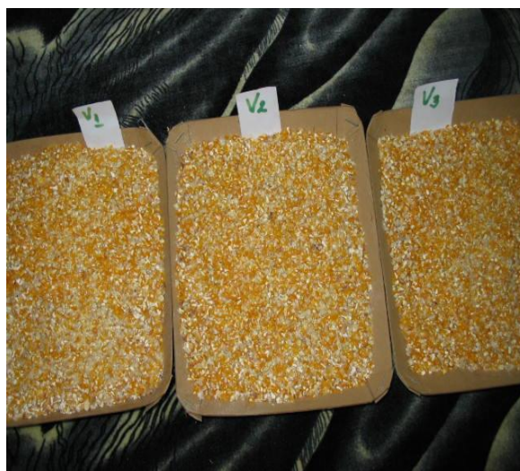
Photo 1. Maize beans subjected to determinations at a 23% H to corn cobs ingathered at 15.1% humidity

After the maize beans were ingathered (100 beans), they were subjected to determinations of expandability at 60°C and 23% humidity. In this way it is performed the first determination, using gas flame, and, after a period of 3 minutes, it results: 33 very well expanded beans, 31 medium expanded beans and 36 unexpanded beans. If the exposure time increases the beans are burnt.