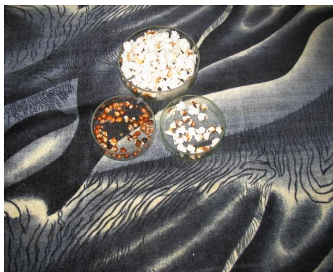
Photo 4. The process of Fundulea 625 beans expansion at different temperatures