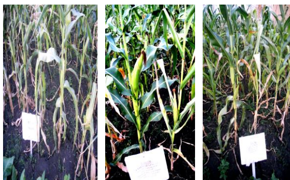
Photo 2. Physiological development of crops in the third phenological phase.

In the experimental lot I cultivated with maize additional fertilization, was given in three rounds: I - three to four leaves appearance; II - before the advent of ear; III - after the emergence of ear. Observations on the physiological development of maize were carried out over four phenological stages. As a result of research concerning the development of phases of maize plants from the experiment was found that in the first two phenological phases, the key differences between the physiological state of the plants growing on the control lot and those experimental were not found. Some differences began to appear in the third phenological stage of the development of maize when it was found that in the experimental lot I, were kept more green plants than in the control lot and in the experimental lot II (Photo 2).