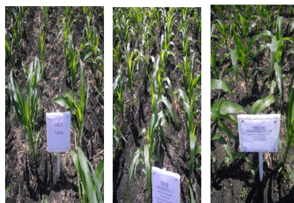
Photo 1. Physiological development of maize plants: a) the control lot; b) the experimental lot I; c) the experimental lot II

As a result of observations carried out on the process of plant emergence it was found that the maize on the experimental lot I and II had emerged respectively with 3 days and 5 days earlier and had developed better than plants on the control lot (Photo 1).