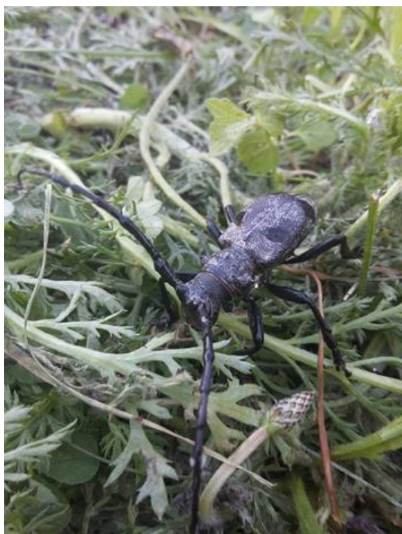
Photo 2. Morimus funereus Mulsant, 1862 (Coleoptera: Cerambycidae) (Original photo)

The body is black, his dorsal side shows a very dense pubescent lying, gray-silver, which completely covers the background (fig.2). Bandannas have two soft spots, black, one located in the front third and the other is postmedian; under these spots the bandannas fund is not grainy. The antennae of males are 1-1.5 times longer than bandannas and females have approximately the same length as bandannas. Body length - 18-38 mm.