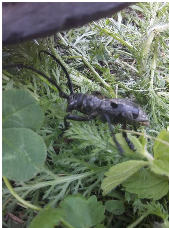
Photo 3. Morimus funereus Mulsant, 1862 in habitat

logs. The larvae are inner bark (phloem) feeders, found in the first stage of decomposition of trees [6].