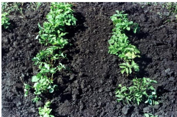
Photo 1. Variant V2 for the cultivation in the field of Angelica archangelica 'De Cristian'

for each plant rosette and sun has definitively a positive influence in this developing process.