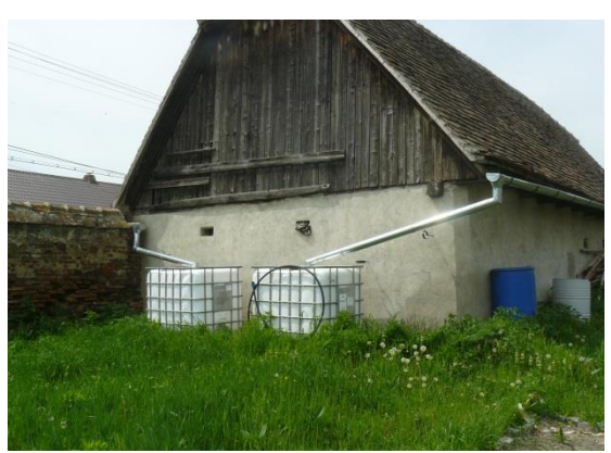
Fig. 3. The colleting rain water in Gușterița (original photo)

Another objective of our researches was the identification of the epigealfauna in the studied agroecosystem till the order level. The knowledge of the faunistical components and interrelationship between different structural parts of the agro-biocenosis Gușterița has a special importance for the establishment of the most effective phytosanitary measures and in the same time the total removing of the chemical materials used for the eliminating the animal and vegetal pest.