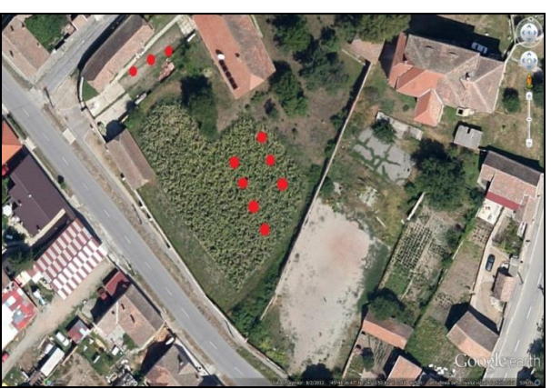
Fig. 1. The setting of the "Barber traps" in the studient agroecosystem

The biologicol material was collected in the plastic container, in 70% alcohol, one for every traps (sample) and them it was studied in laboratory.