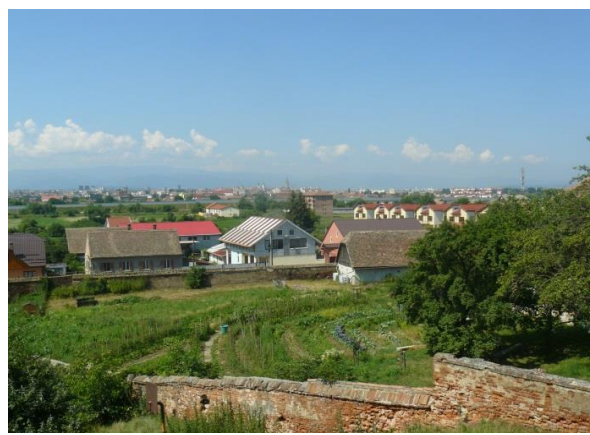
Fig. 2. The ecological garden Gușterița (original photo)

In this context was refounded the "Priestess's garden" [1] a garden with vegetables (Fig. 2), as the first informal, educational school in our county Sibiu. Here is applied technology of culture that respect the methodology of the traditional and ecological works accepted by ecological agriculture (Table 2).