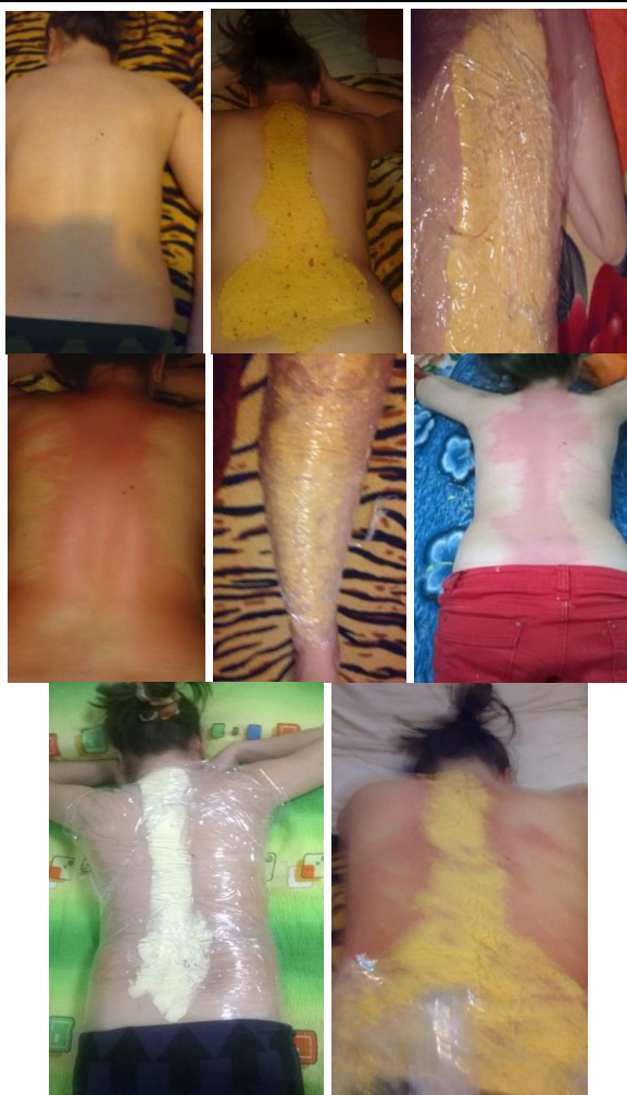
Fig. 2. Results obtained after the appliance of the natural cream against the cold