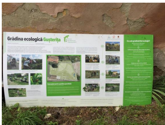
Photo 1. Environmental Education Center Evangelical Church Gusterița- Sibiu (orig.)

This study was conducted on the surface of 4,800 m 2 vegetable garden inside the Evangelical Church in Gusterița neighborhood in the city of Sibiu. GPS location coordinates are 45 ° 44 '13.74' north latitude and 24 ° 06 '22.26' East longitude. (Photo 1).