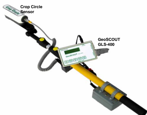
Photo 2. Crop Circle ACS-430

The data measured by Crop Circle ACS-430 allowed us to calculate the classic index of grassland vegetation of the plants analyzed, such as NDVI and SRI indexes. These data were collected in the field from October 2015 to experience being continued and in March 2015 until June 2016 (Photo 2). The study was aimed at acquiring and mastering skills in handling the device, field data collection and processing in order to perform statistical interpretations. The device Crop Circle ACS-430 allowed us to use dozens of indices of vegetation detected measurements overhead and transmitted via satellite using GPS applications by remote sensing plot analyzed in a certain time when vegetation from grassland was in various stages of evolution.