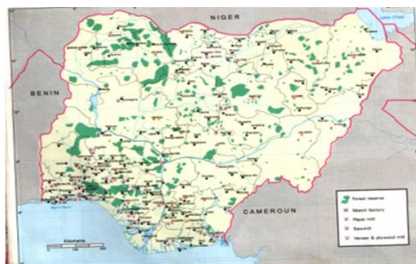
Figure 1: Map of Nigeria showing the Forest Resources, 2005

and that the forest may have great difficulty in growing up again once man's exploitation has exposed the underlying sand.