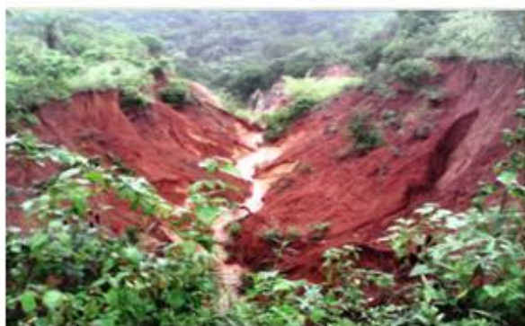
Plate 4: Gully in abandoned farmland in Anambra State