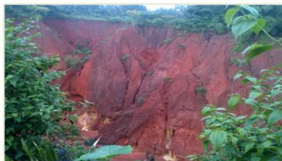
Plate 1: Exposed Land in Edo State.

Farmers are not aware of the need to incorporate grass mulch and/or organic manure to strengthen the soil physically and chemically. And the effects of gully erosion in exposed deforested areas were visible. Dry season cultivation is absent. These are contrary to literature presentation and some of the observations are shown in the plates below.