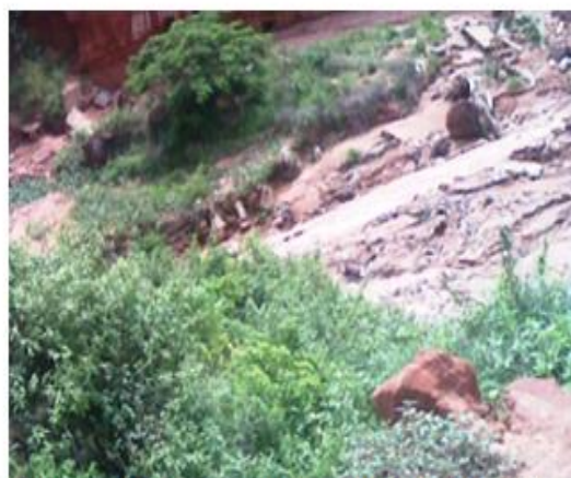
Plate 5: sheet erosion in central Cross River State

(3)Some few machines have been invented and produced for seeding/planting arable crops like yam, cocoyam and cassava but the commercialisation of these as well as successful year-in year-out production on the field is still a mirage.