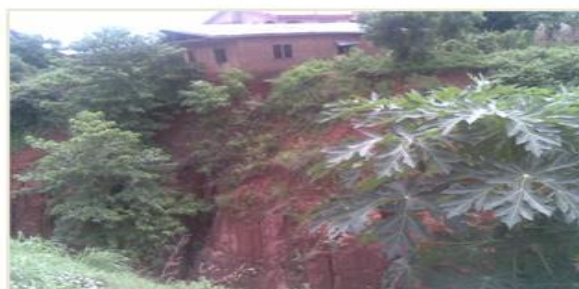
Plate 2: Exposed Land in Ondo State