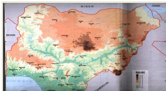
Figure 2 : Map of Nigeria showing Physical Features

The country Nigeria lies between Longitude 3^{\circ} and 15^{\circ} East of the Greenwich Meridian and Latitude 4^{\circ} and 14^{\circ} North of the Equator. The Tropical Rain Forest area is found between Latitude 5\frac{1}{2}^{\circ} and 7^{\circ} North of the Equator; stretching from Ogun State in the South-West through Benin in the Mid-West to South Eastern State of Cross River (Northern Part). Figures 2, 3, and 4 show the physical features, Soil distribution and Vegetation respectively.