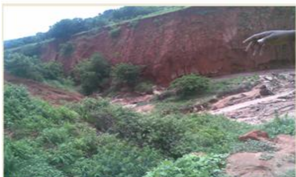
Plate 3: Gully Erosion in Imo State