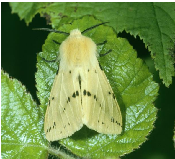
Photo 7. Spilosoma lutea

Collecting fauna by this method is representative of Lepidoptera [2-10, 16-29, 40-42] species and for other groups of insects, beetles ( Carabidae , Coccinellidae , Elateridae ), contributing to improving knowledge of entomofauna useful in the study area [14,43-47].