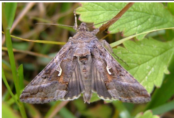
Photo 5. Autographa gamma