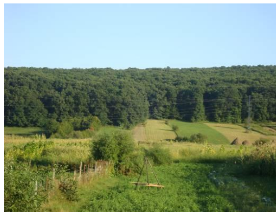
Photo 1. Meadows of 3000 m 2 in the village of

It watched inventory pest, establishing distribution area, highlighting the activity is flying and sometime in the life cycle, the alert warning time for establishing optimum periods of combat.