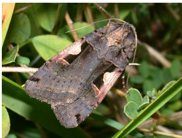
Photo 2. Xestia c. nigrum

Lepidoptera species dominated the Fam. Noctuidae: Xestia c. Nigrum (Photo 2), 944