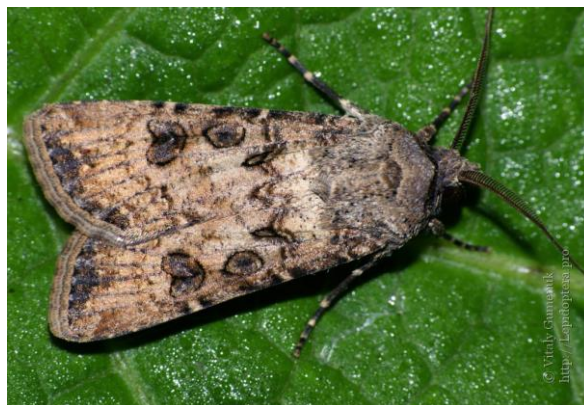
Photo 3. Agroti segetum

copies of which 231 copies, 28.1% (2013), 264 specimens, 23% (2015). Agroti segetum (Photo 3), - 354 samples of which were 147 copies collected in 2015.