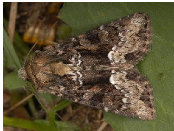
Photo 4. Oligia strigilis

From table 1 it is observed a large number of lepidopteran belonging to the Fam. Actiidae-11.0% in 985 copies, with 354 copies flight in July-August to 12.8% and 276 copies- 11.2%.