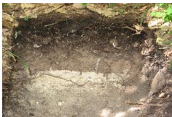
Fig. 5. Rendzinas developed from Upper Baden limestone of Rostochchya region

Well-developed structure (usually angular blocky or fine sub- to angular blocky structure), pH H2O 7.62-7.73. Bulk density – 1.45-1.52 Mg/m 3 . In the lower part of the horizon (depth 20-25 cm) bulk density – 1.48-1.63 Mg/m 3 ;