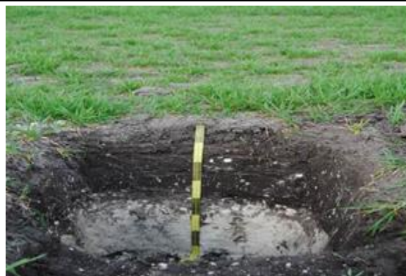
Fig. 3. Rendzinas developed from cretaceous marl, Malyi Polisia region