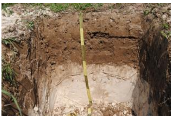
Fig. 2. Rendzinas developed from chalk, Volynian Polisia region