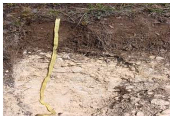
Fig. 4. Rendzinas developed from marly opoka, Western Podolia region