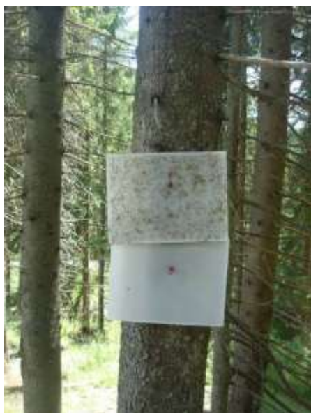
Fig. 2. Pheromone traps installed in stand (orig.)

In the cases with significant ties we established also the respective regressions.