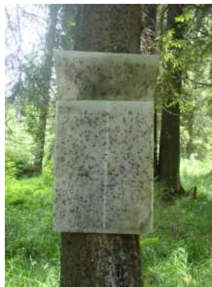
Fig. 3. Atralymon pheromone traps (orig.)

conditions both on the pheromone attraction and on the level of the insect populations.