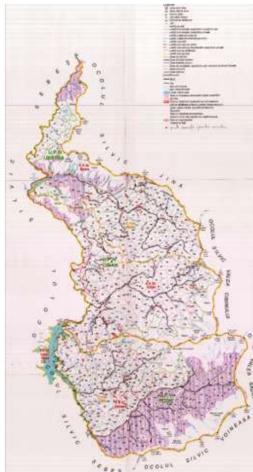
Fig.1. Region Map (orig.)

downstream located, on the line of highest slope and going on clockwise in the three plantations of the Miercurea Sibiului Forest [24] Range and the traps 82 to 85 in the Tilișca Forest Range.