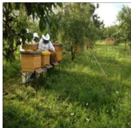
Fig. 2 Stall in Săliște in the apple orchard (original)

Fruit trees and berries: Malus domestica Borkh (Fig 2), Prunus domestica L.;