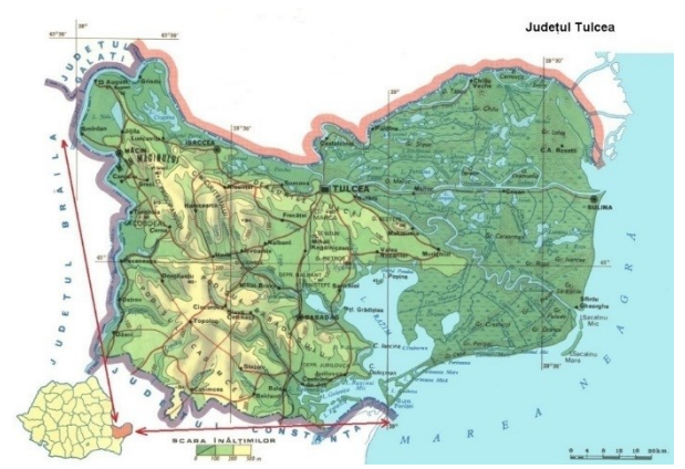
Fig. 1. Location of Tulcea County

Tulcea County is located in the southerneastern part of Romania, in Dobrogea region. Its neighbors are Constanța County in the South, Brăila County in the West, Galați County and the border with Ukraine in the North and the Black Sea in the East (Fig. 1).