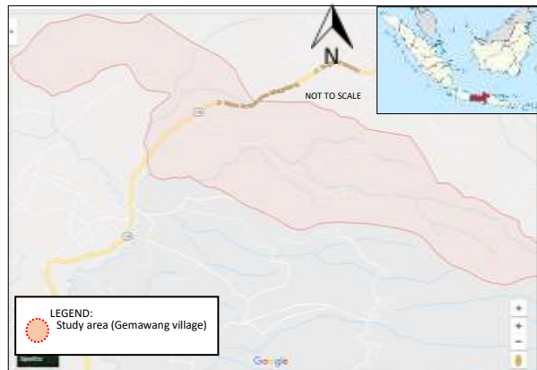
Fig.4. Location of study area at Gemawang village, Semarang Regency, Central Java, Indonesia.

With advancement of manufacturing and ICT technologies, the pottery making process in Sayong had undergone significant changes. For many entrepreneurs, manual works of shaping the clay vast has gradually been replaced with the use of mould press. This is to ensure uniformity and standardization of end products. Although for some clients and/or tourists, the usage of modern method including mould press might affect the authenticity of Labu Sayong (because each vast is too perfectly shaped!), from the entrepreneurs’ point of view, using some technologies would allow less experience workers to be employed to carry out the job [10].