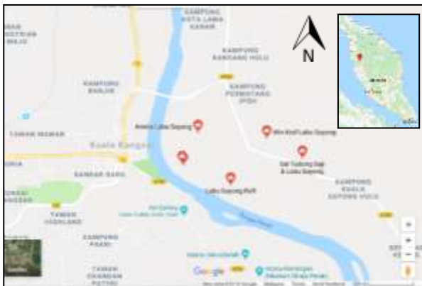
Fig.3. Location of study area at Sayong village, Kuala Kangsar district, Malaysia.

popular pottery product known as “Labu Sayong” and located in Kuala Kangsar district in Perak state, Malaysia. The selection of Sayong village in particular made after reviewing all relevant information on ODOI (One District One Industry) producers in Malaysia from the ministry of Rural and Regional Development and Malaysia Craft Agency (commonly known as Kraftangan Malaysia ) [4]. Based on report from Kraftangan Malaysia , there are at least 35 active pottery makers and entrepreneurs in Kuala Kangsar and many of them concentrating in Sayong area since clay from Sayong is considered the best quality for Labu Sayong pottery [10] (Fig. 3).