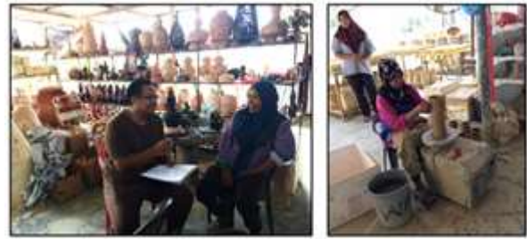
Photo 1 and 2. Pottery making process in Sayong village, Kuala Kangsar

Majority of respondents participated in this study are the pottery makers. They are diversifying their craft/pottery business by integrating workshop (production area) and sales gallery (or souvenir shop) for tourism purposes. In every visit, visitors will be presented with live demonstration by the pottery craftsmen on moulding process (i.e. how to press liquid clay into moulds of various shapes and sizes) and then using the spinning machine for pottery decoration before drying process of end products. Every visitor/tourist can participate in these processes via interactive “learning by doing” activity (Photo 1 and 2). Moreover, they can purchase and bring home their own hand craft pottery after the activity. Many of tourist are school children which on their school trip and also some tourists from abroad [10].