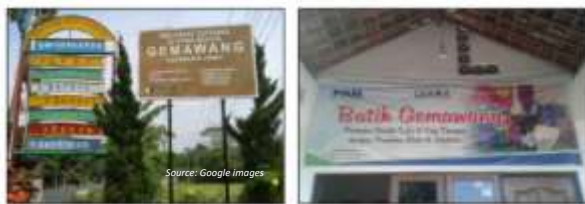
Photo 3 and 4. Batik production and development of Gemawang as tourism village in Semarang Regency.

Temanggung and Magelang regencies, with population of 3,456 people. The village of Gemawang was chosen as one of test site under “Vocational Village project” by the Centre for Non-Formal and Informal Development (P2PNFI) (now P2PAUDNI) Regional II in 2004 [1]. At that time, there are three business groups which actively involved in batik and food-based SMEs. All three businesses were selected for detail study prior to their utilisation of local resources in production of batik and food (Photo 3 and 4). Information from P2PNFI indicated that the vocational village program has improved vocational skills among local entrepreneurs and craftsman, hence strengthening business group development in facing future challenges. In addition, majority of program participants are now enjoyed economic improvement, better social status, mindset changes, increase literacy and ability to plan for their own future [6].