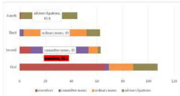
Fig. 1. Levels of information flow sequence within CDAs from the first to fourth

chain of information flow on community development issues. Correspondingly, about half (49%) affirmed that the general members get informed of relevant issues at the third level while patrons/ advisers were indicated by 45% as the last to be updated with information on the CDA issues of interest.