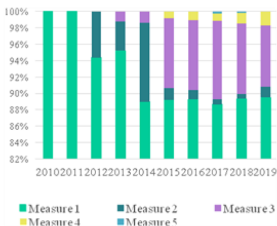
Fig. 2. Number of subsidies beneficiaries by main supported measures

The most of farmers received a subsidy under first measure “Investments in agricultural explorations to restructure and adapt to European Union standards” in average 3,157 recipients over last ten years. However the greatest number of farmers (5,841 or 89 percent) received a subsidy under this measure in 2018 (Figure 2). The greatest amount under this measure belong to investments for establishing multiannual plantations, purchasing technique and equipment, the use and technological renovation of livestock farms (43 percent from total subsidies in 2019). Moreover, the subsidies are targeted to support sectors that are already self sufficient and enough competitive with high export shares.