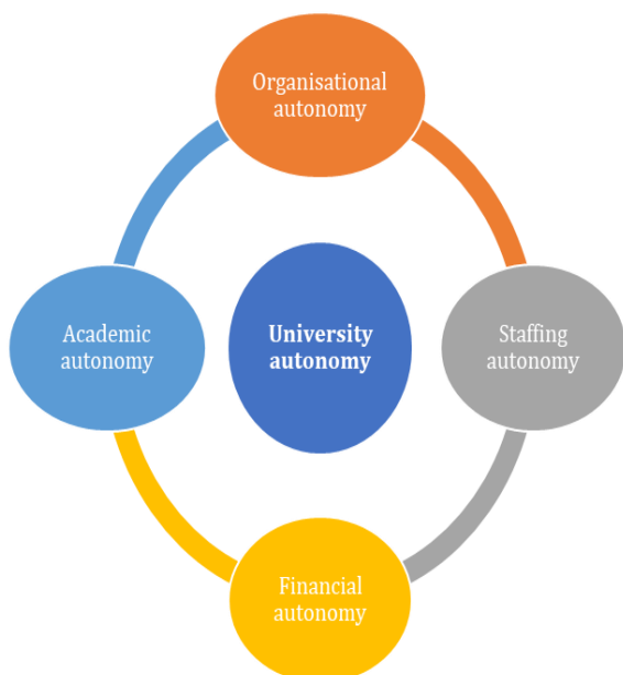
Fig. 1. University autonomy dimensions

To measure the extent to which the principle of university autonomy is implemented, it has been used the dimensions proposed by the European University Association [5] and illustrated in the following diagram: