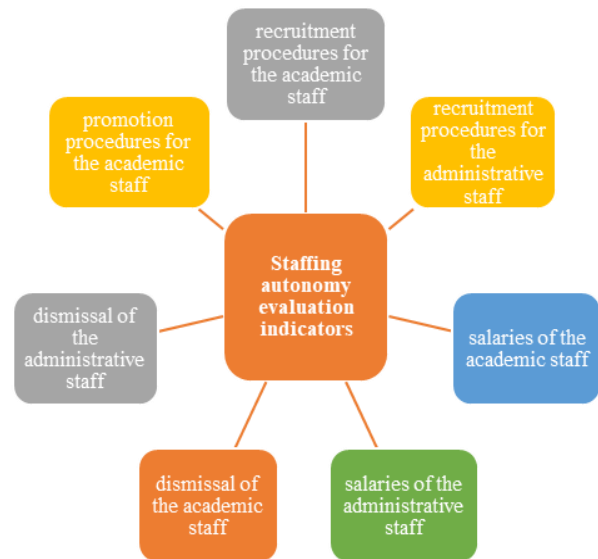
Fig. 3. European evaluation indicators of staffing autonomy dimension

The staffing autonomy - that is the freedom to decide on personnel issues – is the second element analyzed. The ability of a university to attract, manage and retain quality human resources, both academic and administrative, ensures its success in the global higher education environment. Eight evaluation indicators are presented: