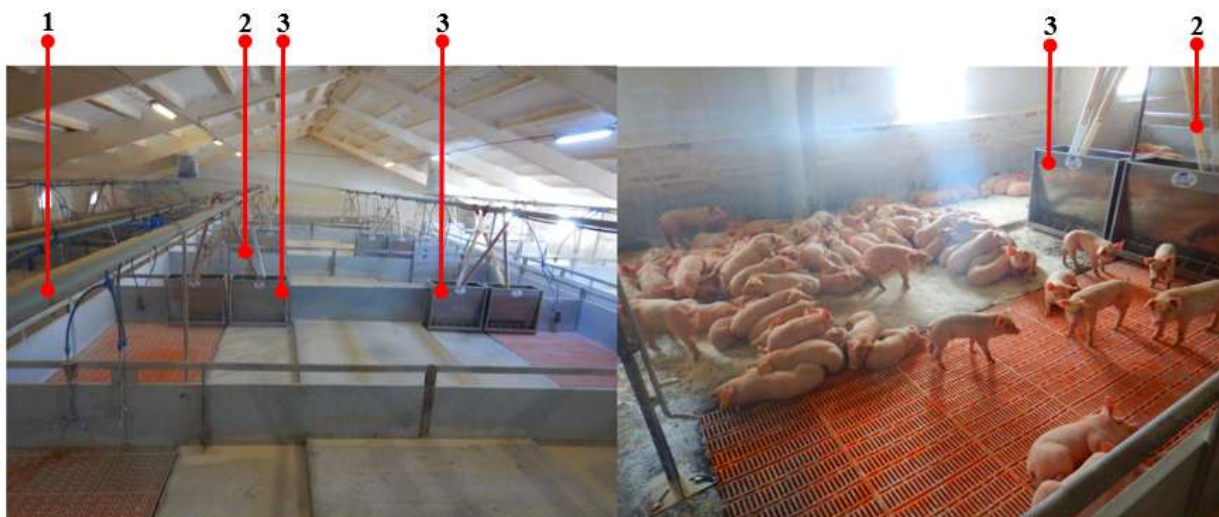
Photo 1. Conditions of keeping piglets of group I.

From the first day of rearing, control group I animals received a dry feed from the American Hog Slat feeders (Photo 1). The feed front was 2.5 cm per piglet that was in the vending pen. The number of feeding places in each automat was 24. The feed was transported to the feeders by a chain and pulley conveyor. The filling of the self-loading bunkers was controlled automatically. In the first days after weaning, to accustom the piglets more quickly to feed intake, the mixed feed was added to the main feeders four times a day and scattered on a solid part of the floor. The piglets were also given a mixture of one part mixed feed and three parts warm acidified water in portable drinkers six times daily. The mixed feed, which the piglets were to learn to eat, was taken from the same bunkers as the feed for the self-feeders. Accounting for the consumed fodder was carried out automatically based on the information obtained from the torsion scales on which the fodder storage hoppers were installed.