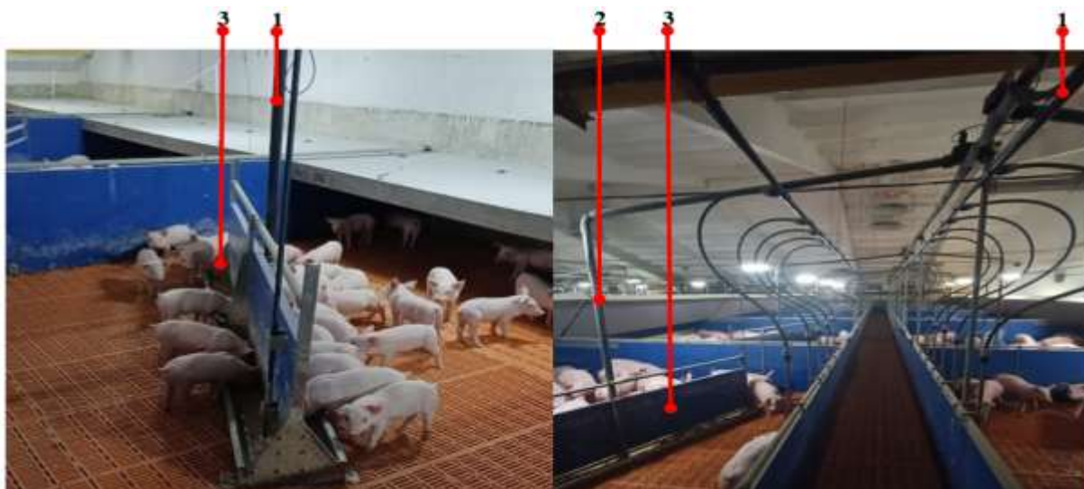
Photo 3. Conditions of keeping piglets of group III. Note: 1 – pipeline, 2 – distribution pipeline, 3 – feeder

each feeding. The frequency of filling the feeders was 12 times per day.