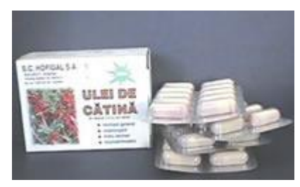
Fig. 3 Variety of Sea buckthorn oil products of S. C. HOFIGAL S. A. from Romania

two appreciate specialists Ovidiu Bojor and Mircea Alexan recommend sea buckthorn as vitamin complex (C, B1, B2, PP) carotenes, folic acid, oil, izoramnethol, fitosterol. Recommended in avitaminose Fructus Hippophae in combination with Fructus Cynosbati (hip rose), Folium Urticae (stinging nettle), gooseberry, Folium Menthae (mint), Folium Rubi idaei (raspberry) and Folium Primulae (cowslip), infusion, cooling drinks, syrups, gout as reach in vitamins and diuretic, pneumonia in combination with colt's foot, linden tree, hyssop, cowslip, savory, elder tree, rickets Fructus Cynosbati (hip rose), Hippophae, Fructus Folium Primulae (cowslip), Folium Melissae (balm mint), adjuvant in pulmonary tuberculosis in winter and spring for vitamins with Fructus Cynosbati (hip rose), Folium Urticae (stinging nettle), Folium Primulae (cowslip), uremia in combination with diabetes Folium Betulae (birch tree), Folium Myrtilli (bilberry) and Herba galegae (goat's rue), xerophthalmia in combination with Fructus Cynosbati (hip rose), Folium Urticae (stinging nettle), Flores Tagetes (marigold) and Fructus Myrtilli (bilberry).