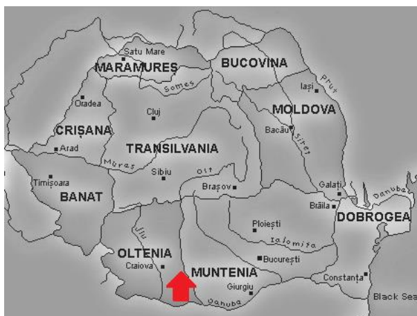
Fig. 1. The geographical position of the Caracal Plain in Romania

It is located at west of the Olt Valley, being characterized by the predominance of slow and relatively flat shapes, which impose a remarkable homogeneity of the landscape, the height varying from 180 – 190 m in the north, to 45 – 50 m in the south [1].