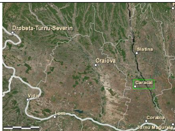
Fig.2. The geographical position of the Caracal Meteorological Station in the Oltenia Region, Romania

The climatic indices were calculated based on simple mathematical formulas [8], dedicated, most relying on the reports of the two meteorological elements: the air temperature and the precipitations [5]. For each index has been presented the way they are calculated.