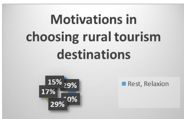
Fig.2. Motivations in choosing rural tourism destinations

As mentioned above the main reasons for rural tourism, played by specialists, thus the respondents were asked „ What motivates you to choose the rural tourism? ” offering five possible answers. Their options were more focused on leisure, recreation and escape to nature, options justified by Graburn theoretical model based on „inversions” of travel.[2] It explains the tendency of tourists to seek temporary something else than usually. The concern is reflected in the increasing of the relaxation time, antithetical with working time.