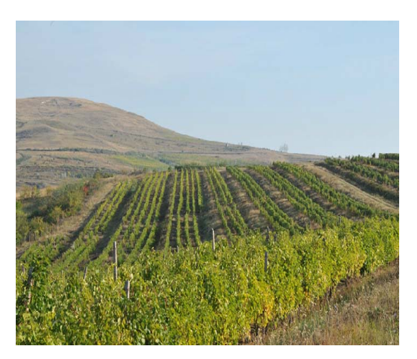
Fig.4. Vineyard Budureasca