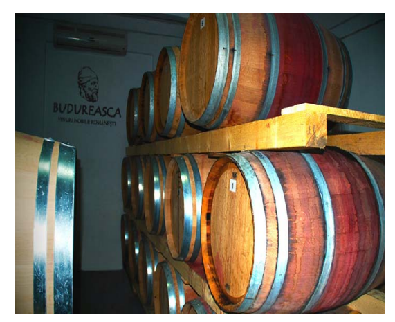
Fig.8. Budureasca Cellar

The tourism potential of the area and the unique beauty of places led naturally to the project of building a resort in the middle of the vineyard (Cretu, 2005).