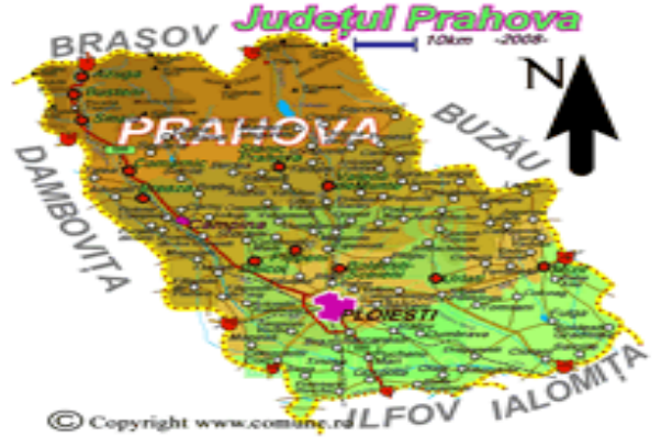
Fig.1. Prahova County map