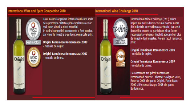
Fig.6. Honors and Awards