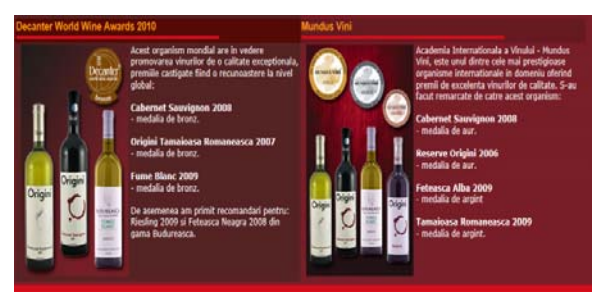
Fig.7. Honors and Awards