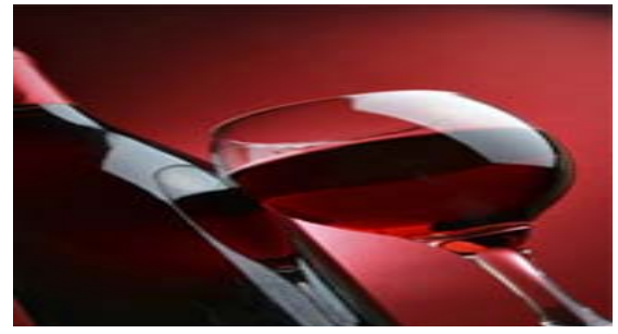
Fig.3. Budureasca Wine

"We are a small producer, but with a well diversified portfolio. Our range includes wines for all tastes and this is where our competitive advantage. We put our heart and passion in wine, which leads us to maintain a high quality standard extreme. We have full control of the grapes used in the wine. Our philosophy is to limit and control the amount of quality in order to obtain the guarantee of a superior wine quality. Bottles coming off the production line in glasses bring our customers the best wines in price and quality and experience and passion that brings oenologist our place in the production process are found in the superior quality of each assortment of brand Origini and Budureasca .