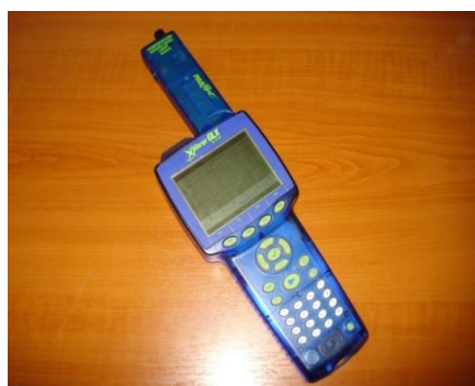
Fig. 2. GLX-explorer

The sound level meter is used for measuring the sound source intensity of 40-130 dB. It is