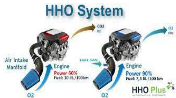
Fig.1. The engine fuelled without Hydrogen compared to the engine with Hydrogen intake

In Fig. 1, in the left side is presented the classic engine and in the right side, the engine fuelled with Hydrogen. As we can observe, the power in case of using Hydrogen as fuel is 90 %, compared to 60 % in the case of classic engine. Also, the fuel consumption at 100 km is much lower in the case of using Hydrogen.